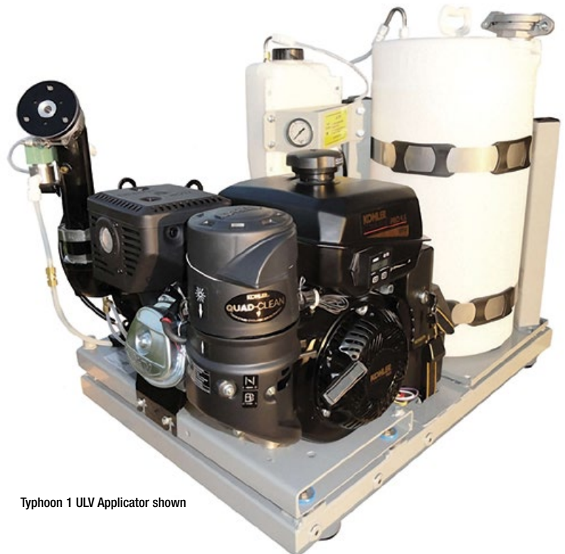
Typhoon 1 ULV Applicator shown

Contact your Even-Spray Sales Representative for more details.