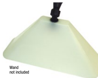
Wand not included