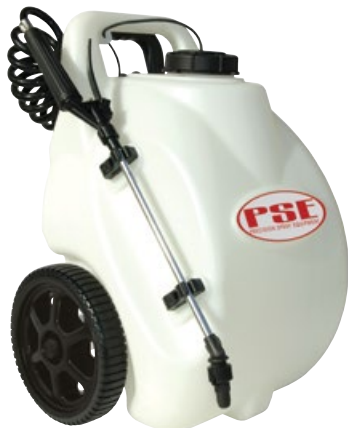
Comes Fully Assembled