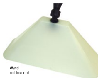
Wand not included