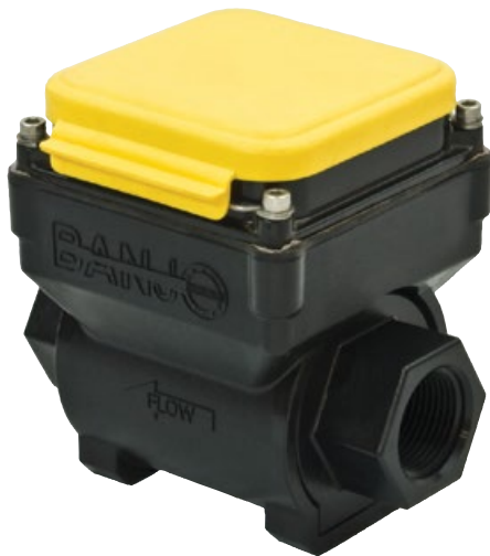
FM100 1" FULL PORT FEMALE NPT FLOW METER