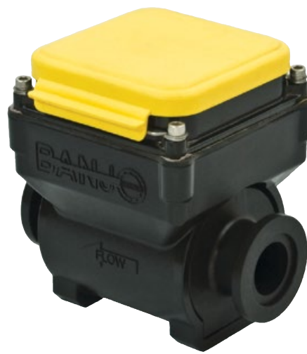
MFM100 1" FULL PORT MANIFOLD FLOW METER