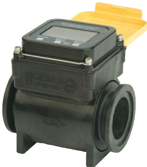
MFM220 2" FULL PORT MANIFOLD FLOW METER