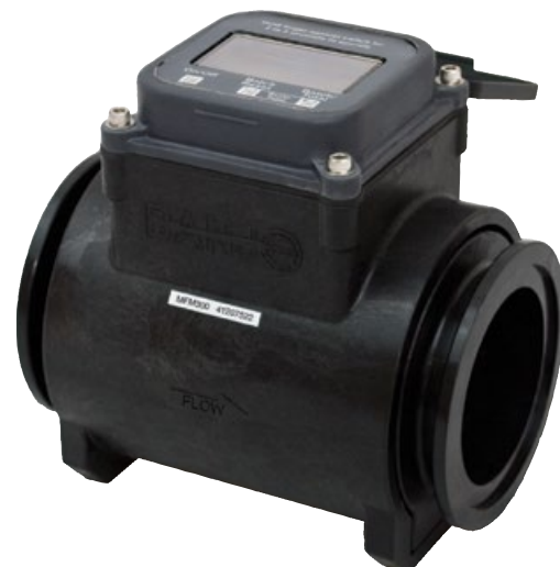
MFM300 3" FULL PORT MANIFOLD FLOW METER