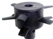
Unique Spike Auger