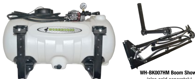
WH-BK007HM Boom Shown (also sold separately)