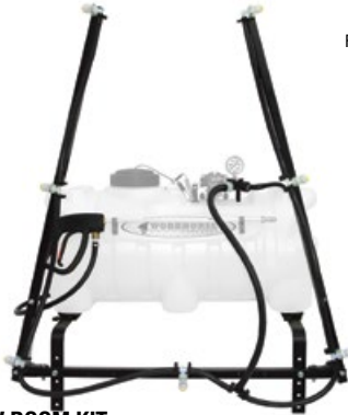
Folds up for storage or transportation.