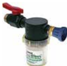
PelletPro™ Applicator Gun