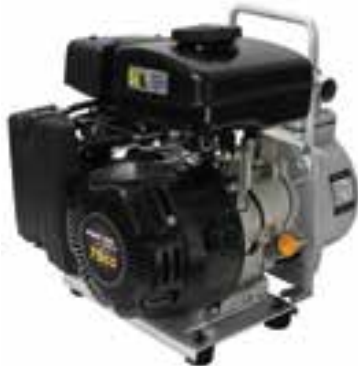
1" Water Transfer Pump w/ Powerease 79cc Engine