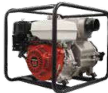
TP-3013HM 3" Trash Pump