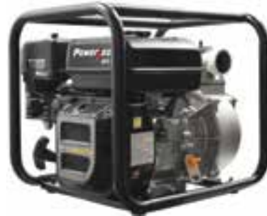
WP-3070S 3" Water Pump