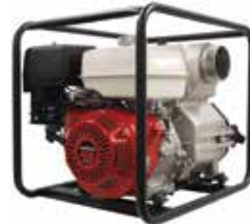
TP-4013HM 4" Trash Pump