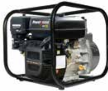
WP-2070S 2" Water Pump