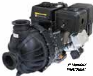
3" Manifold Inlet/Outlet