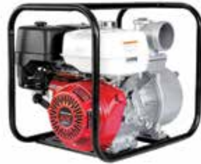
4" Water Transfer Pump w/ Honda GX390 Engine