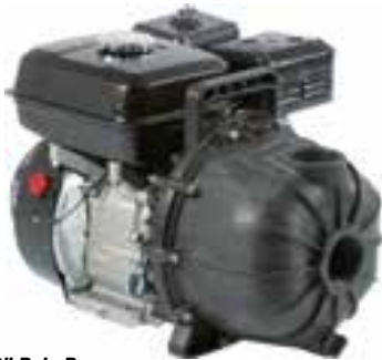
1542P-5SP 2" Poly Pump