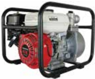
WP-2065HL General Purpose 2" Water Pump