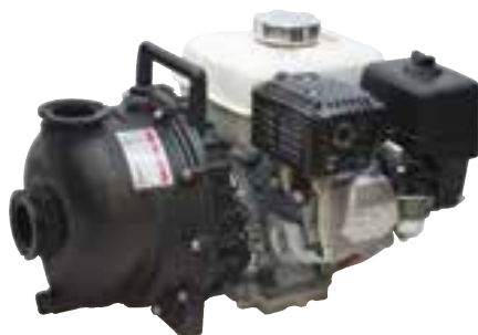
2" Full Port Manifold Inlet / Outlet