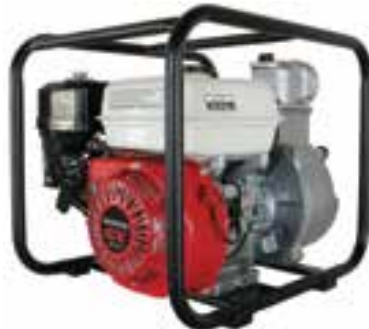
WP-3065HL General Purpose 3" Water Pump