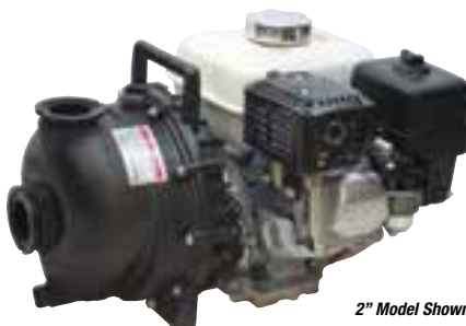
2" Model Shown