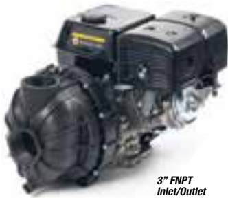
3" FNPT Inlet/Outlet