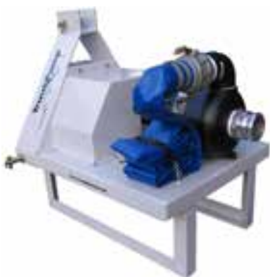
PTO- Driven Model (shown with optional hose kit)