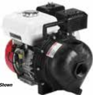
3" Model Shown