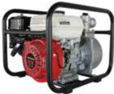
HP-2065HR High Pressure 2" Transfer Pump

High pressure system operates at 65 PSI; ideal for lawn sprinkling and fire fighting.