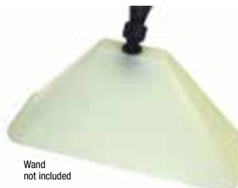
Wand not included