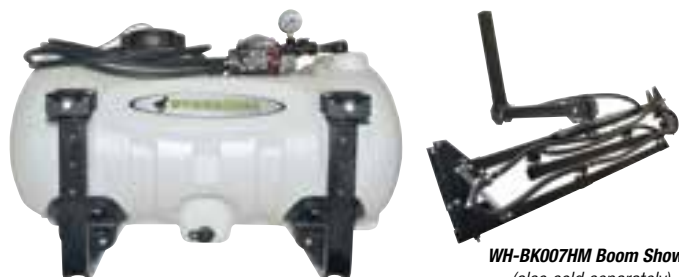
WH-BK007HM Boom Shown (also sold separately)