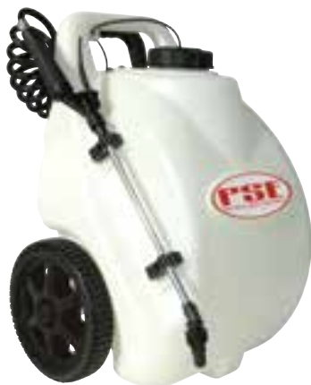
Comes Fully Assembled