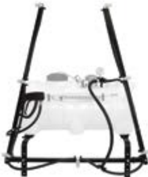
Folds up for storage or transportation.