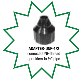
ADAPTER-UNF-1/2 connects UNF-thread sprinklers to 1/2" pipe