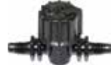
Vari-Flow UNF X UNF