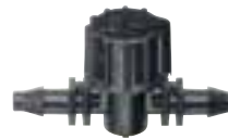
Vari-Flow BARB X BARB