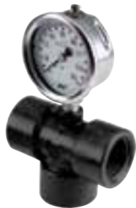
Gauge not included