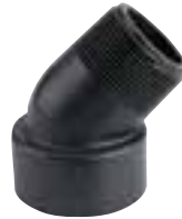
Street Elbow 45°