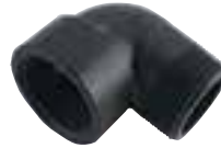
Street Elbow 90°