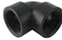
Pipe Elbow 90°