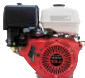
Honda GX390 Series Engines (13 HP)