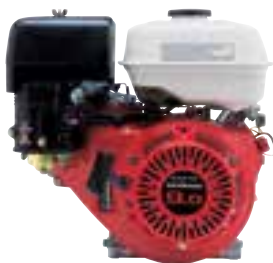
Honda GX270 Series Engines (9 HP)