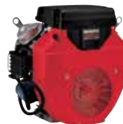
Honda GX690 Engine (24 HP)