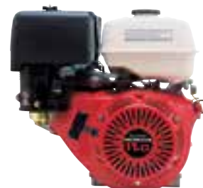
Honda GX340 Series Engines (11 HP)