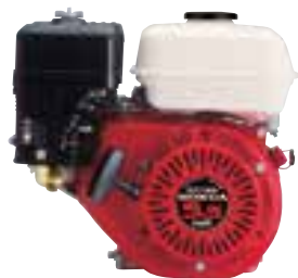
Honda GX160 Series Engine (5 1/2" HP)