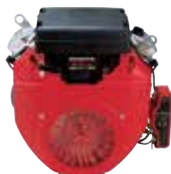
Honda GX 630 Engine (20 HP)