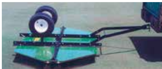
Sweep Mode (wheels up)