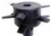
Unique Spike Auger