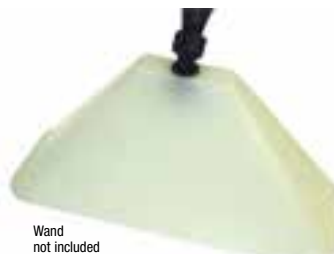
Wand not included