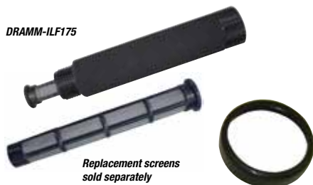
Replacement screens sold separately