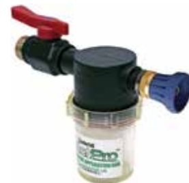
PelletPro™ Applicator Gun