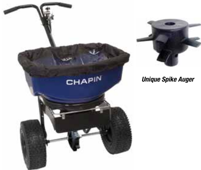
Unique Spike Auger