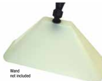
Wand not included