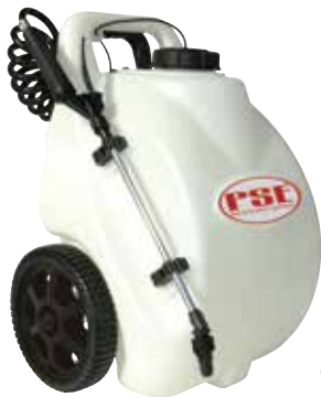
Comes Fully Assembled