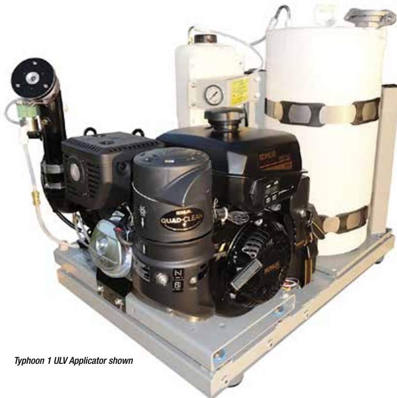
Typhoon 1 ULV Applicator shown

Contact your Even-Spray Sales Representative for more details.