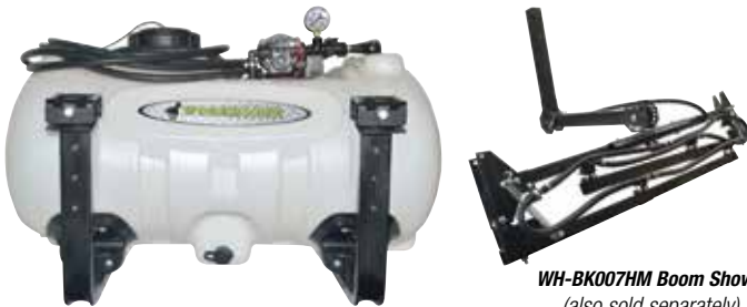
WH-BK007HM Boom Shown (also sold separately)