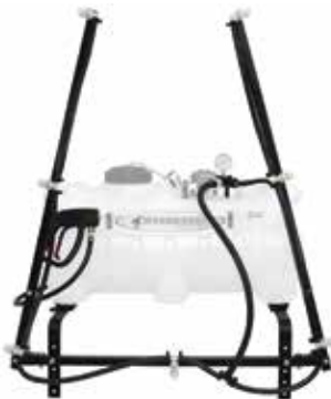
Folds up for storage or transportation.