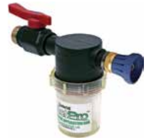
PelletPro™ Applicator Gun