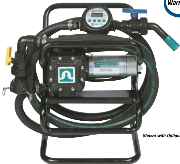
Shown with Optional Meter