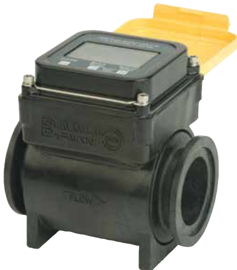
MFM220 2" Full Port Manifold Flow Meter