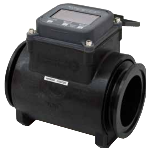
MFM300 3" Full Port Manifold Flow Meter