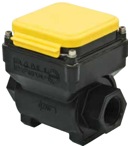
FM100 1" Full Port Female NPT Flow Meter