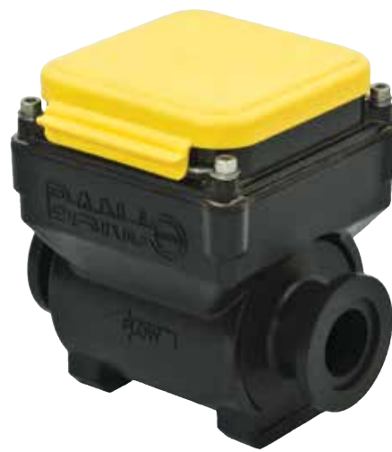
MFM100 1" Full Port Manifold Flow Meter