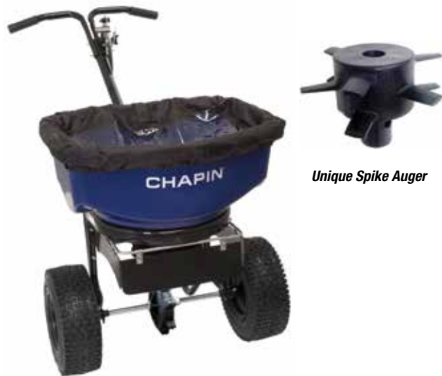
Unique Spike Auger