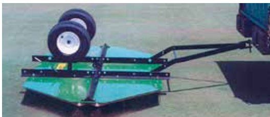
Sweep Mode (wheels up)