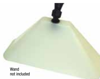
Wand not included